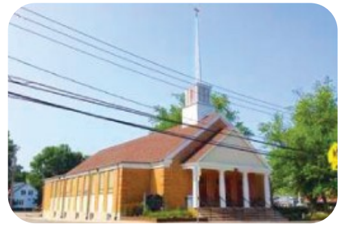
St. John the Apostle