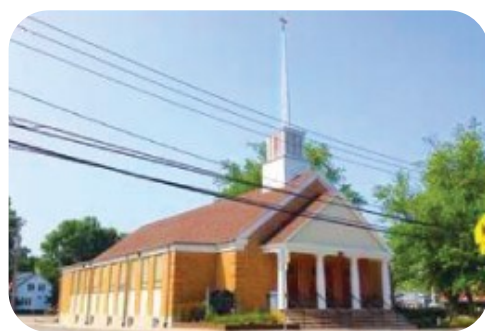
St. John the Apostle