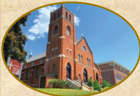
126 Prospect St, Moosup