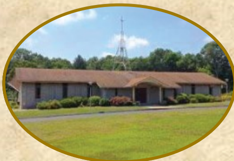
144 Westminster Rd, Canterbury