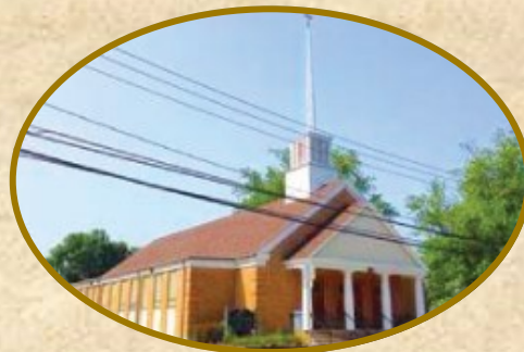
15 Railroad Ave, Plainfield