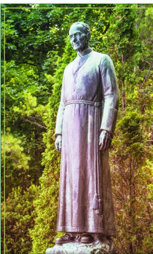
ST. ANDRÉ BESSETTE