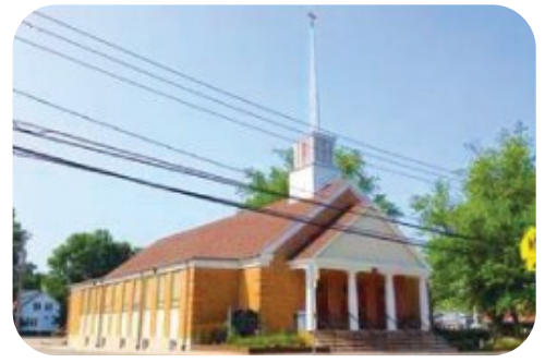
St. John the Apostle 15 Railroad Ave, Plainfield