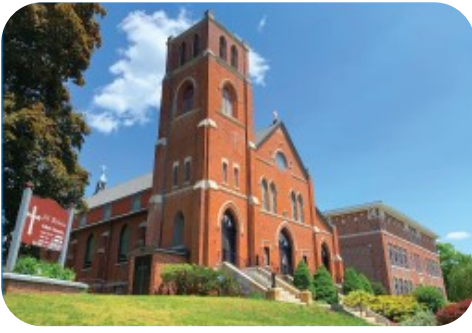
All Hallows 126 Prospect St, Moosup