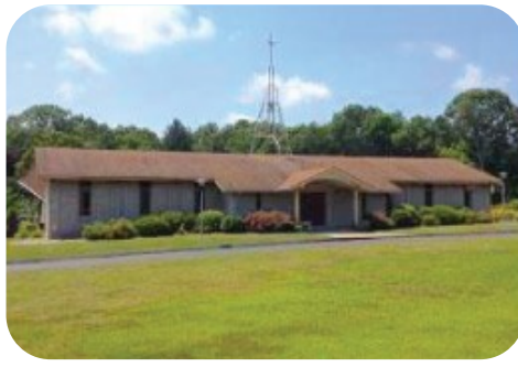
St. Augustine 144 Westminster Rd, Canterbury